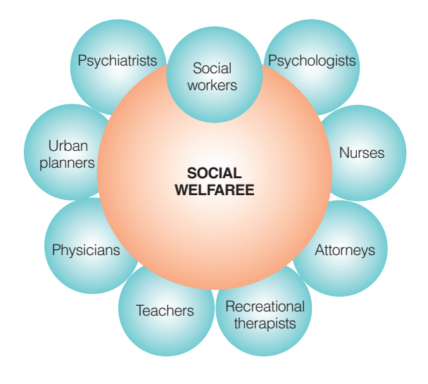
FIGURE 1.2 Examples of Professional Groups within the Field of Social Welfare

knowledge and skills to provide social services for clients (who may be individuals, families, groups, communities, organizations, or society in general). Social workers help people increase their capacities for problem solving and coping and help them obtain needed resources, facilitate interactions between individuals and between people and their environments, make organizations responsible to people, and influence social policies.<sup>6</sup>